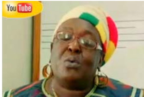
WOMEN OF CALYPSO (YouTube - click to view)