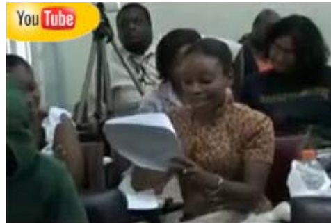
Rhodesa Lecture (YouTube - click to view)

We both visit the Women's Prison at Golden Grove, leading a highly energetic interactive performance for two hundred incarcerated women!