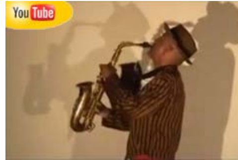
Love Project at Tampa Bay Performing Arts Center (YouTube - click to view)