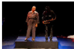
Photo Gallery: "Big-Butt Girls" at Praktika Theatre, Moscow Russia

A picture is worth a thousand words . . .