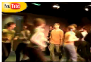
Creative Performance Workshop (YouTube - click to view)