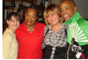
Photo Gallery: Workshop, Moscow State