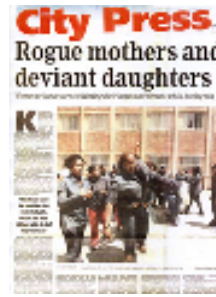
Page 1 | Page 2