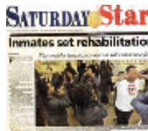
Page 1 | Page 2