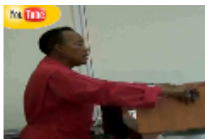
Rho lecture Ryazan (YouTube - click to view)