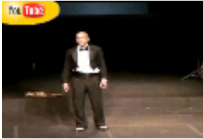
Music for One Hand Clapping (YouTube - click to view)