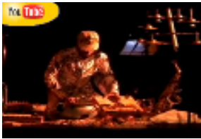
The Breach Part II (YouTube - click to view)

The performances went fabulous! In the maestro Billy Strayhorn's words "Onward and Upwards!"