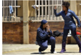
Photo Gallery: "Serious Fun" at Naturena Women's Prison, South Africa