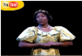
Unsung Diva (YouTube - click to view)