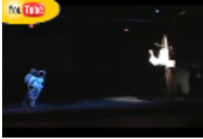
"The Breach" - The Angel (YouTube - click to view)