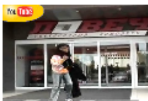
Back to Moscow (YouTube - click to view)